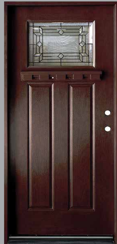
FM300A Shown as Dark Walnut