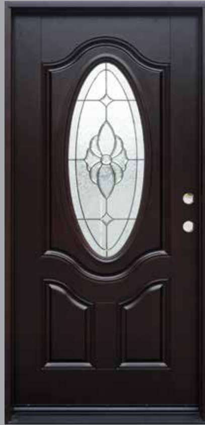
FM800A Shown as Dark Walnut