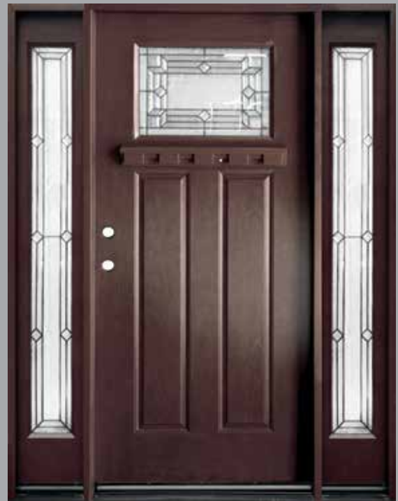
FM300AM Shown as Dark Walnut