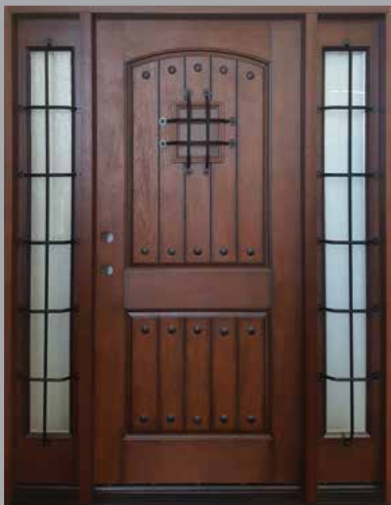
FM200W Shown as Classic