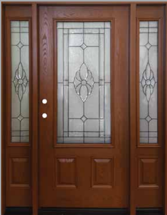
FO301A Shown as Cherry