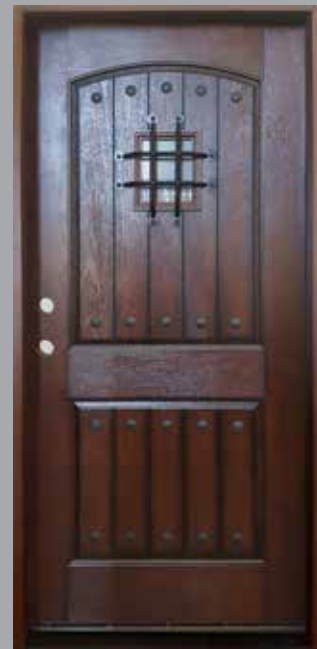
FM200W Shown as Classic

Slab Size: 35-1/2" x 78-1/2" Unit Size: 37-1/4" x 81" Jamb Option: 4-9/16", 5-1/4" Available Finish: DW