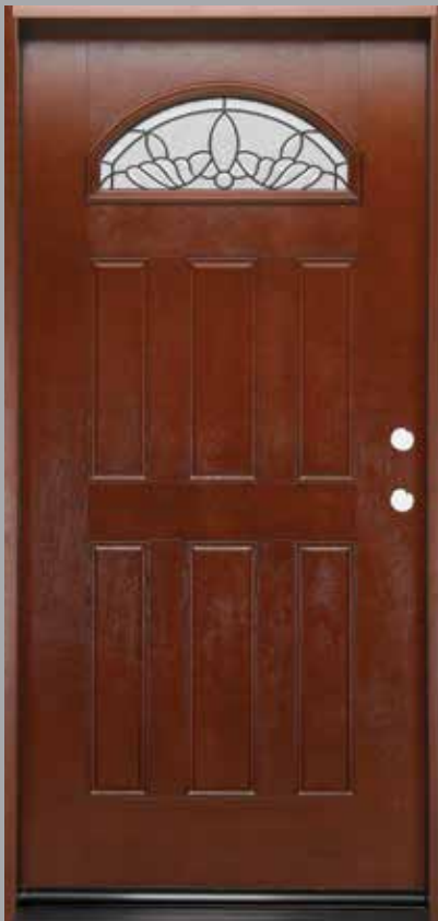
FM285B Shown as Mahogany