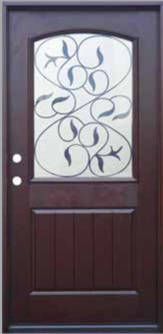
FM200I Shown as Dark Walnut

Slab Size: 35-1/2" x 78-1/2" Unit Size: 37-1/4" x 81" Jamb Option: 4-9/16", 5-1/4" Available Finish: DW MW