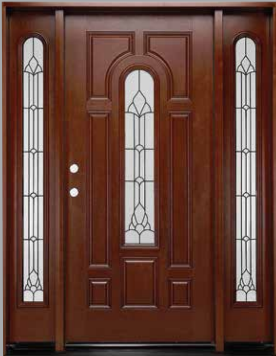
FM280D Shown as Mahogany