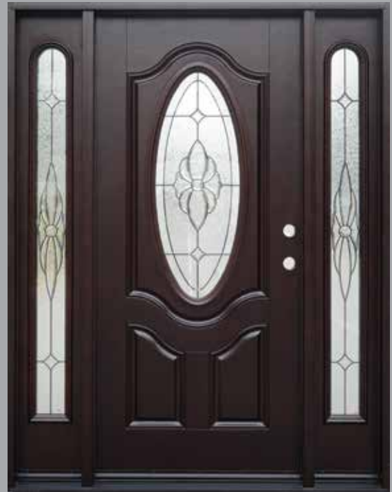
FM800A Shown as Dark Walnut