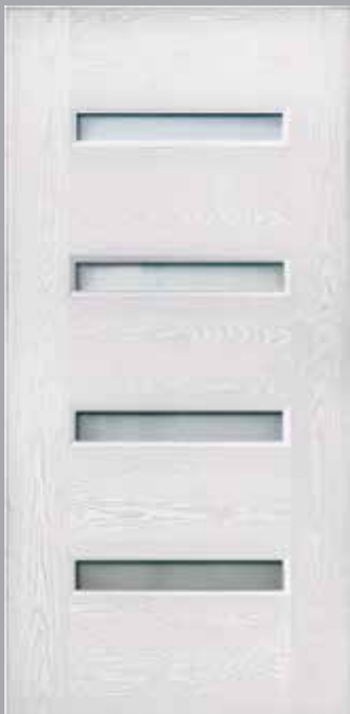
FO104F Shown as White

Slab Size: 35-1/2" x 78-1/2" Unit Size: 37-1/4" x 81" Jamb Option: 4-9/16", 5-1/4" Available Finish: DW WH