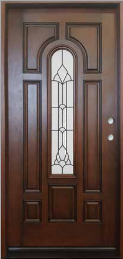
FM280D Shown as Classic