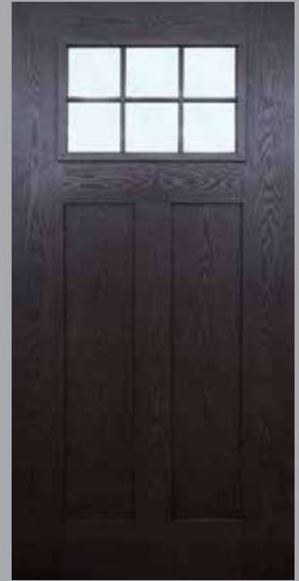
FO330-6lite Shown as Dark Walnut

Slab Size: 35-1/2" x 78-1/2" Unit Size: 37-1/4" x 81" Jamb Option: 4-9/16", 5-1/4" Available Finish: DW CR