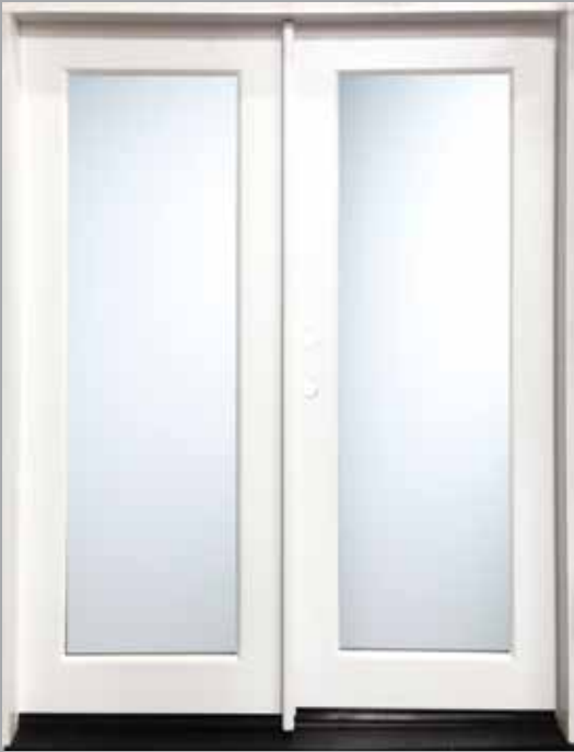
FS100 Shown as White