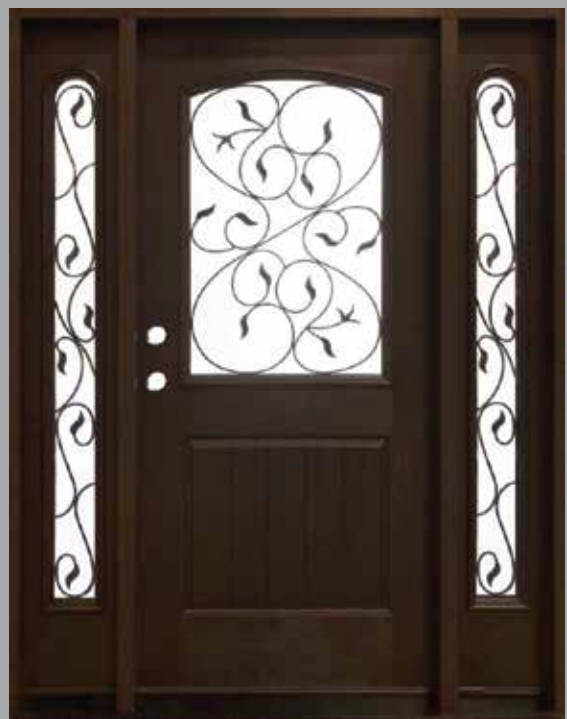
FM200IM Shown as Dark Walnut