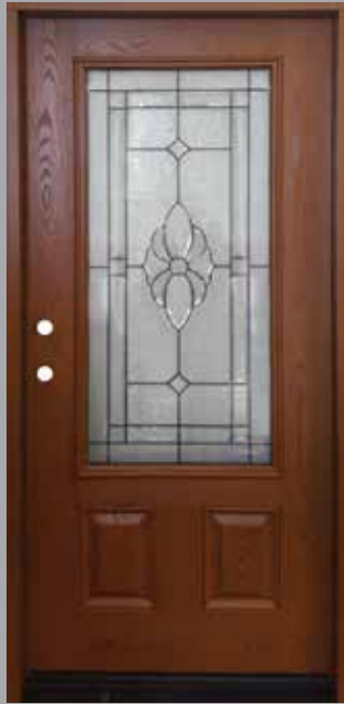
FO301A Shown as Cherry

Slab Size: 35-1/2" x 78-1/2" Unit Size: 37-1/4" x 81" Jamb Option: 4-9/16", 5-1/4" Available Finish: DW MW