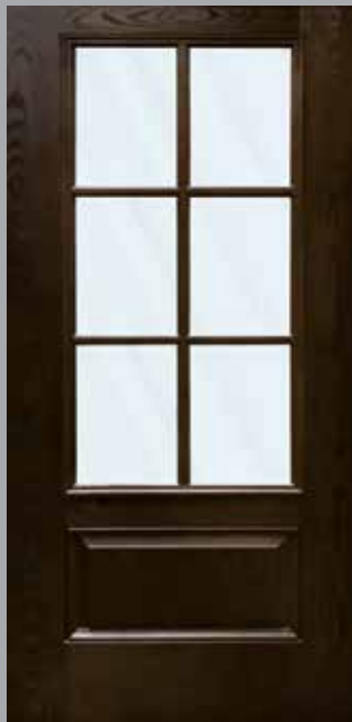
FO201-6lite Shown as Dark Walnut

Slab Size: 35-1/2" x 78-1/2" Unit Size: 37-1/4" x 81" Jamb Option: 4-9/16", 5-1/4" Available Finish: WH